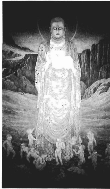
Temple painting of Mizuko Jizō