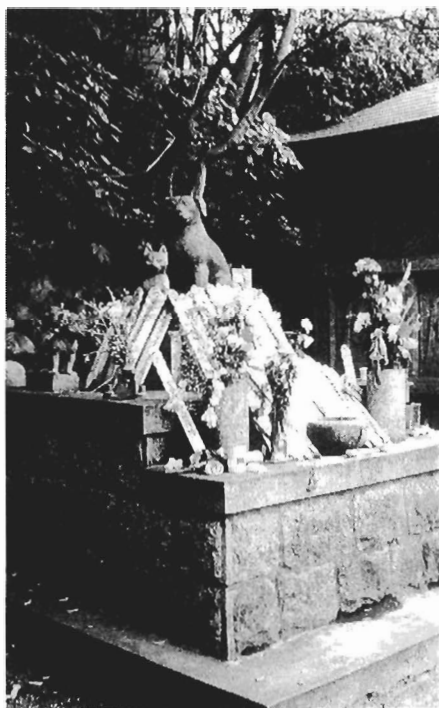
A corner for petto-kuyō

As regards the oft-invoked Shinshū opposition to abortion, it should