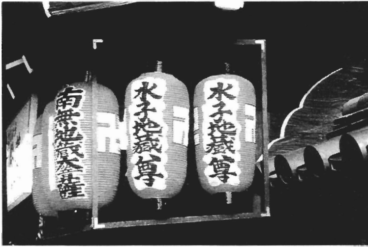
Mizuko Jizō lanterns