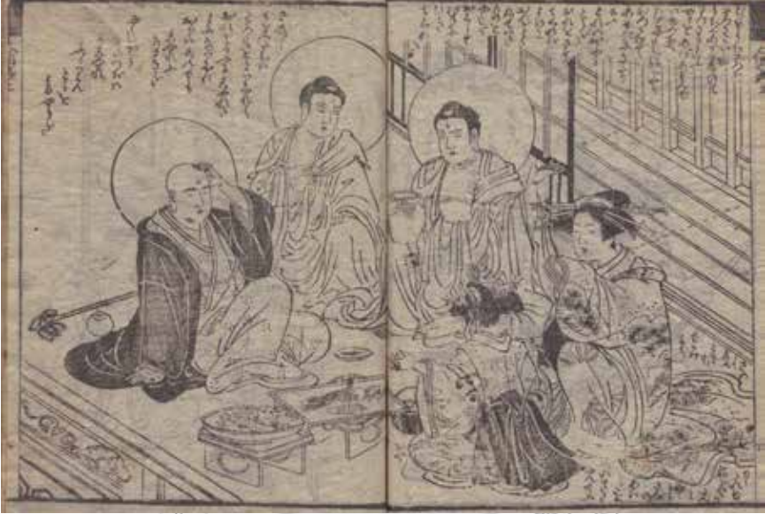
FIGURE 1. Shikamuni, Yakushi, and Jizō mingling with courtesans (from A Revealing of the Refined Buddhas in the Contemporary World , National Diet Library).

irreverent or playful stance on religion, kibyōshi served as an important avenue through which a significant number of individuals interacted with religious symbols in the late eighteenth century. This is an aspect of Japanese religion that is impossible to grasp through an analysis of documents produced by religious professionals alone.