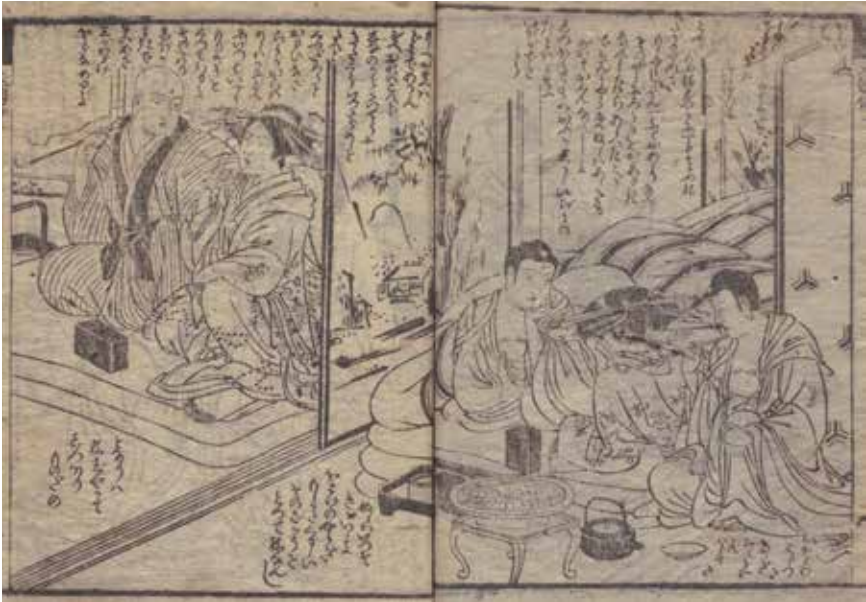
FIGURE 4. Jizō and the two Buddhas spending the night with courtesans.

eventually learns of his father's depravity. The son seeks help from Kōbō Daishi, who agrees to accompany him to Edo in an attempt to convince the father Jizō to come to his senses. This effort proves futile, however, and the father Jizō decides to elope with Matsuwaka. Mimicking the plot of a popular song ( yōkyoku 謡曲) in which a tengu 天狗 kidnaps a child named Matsuwaka, Jizō camouflages himself as a tengu and flies away with his favorite courtesan. Thereafter, Jizō lives peacefully with Matsuwaka making a living as an eye doctor. Jizō's occupation as an eye doctor is most likely a parody of a Jizō statue at Sensōji in Asakusa, particularly famous at the time for its efficacy in curing eye-related diseases.