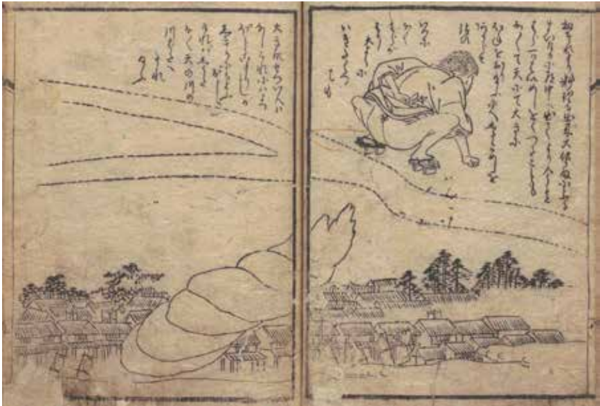
FIGURE 3. The Big Buddha defecating on the Milky Way.

head reaching into heaven. Heavenly deities are at first startled by the Big Buddha's sudden appearance but soon invite him to the Heavenly Emperor's palace. The Big Buddha receives a warm welcome from the Heavenly Emperor.